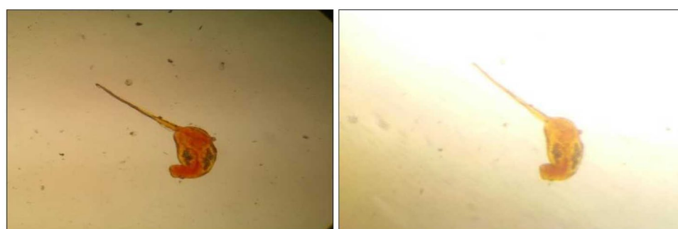
Figure 3. Image of Echinostome cercariae shed by Bulinus snails, Alwero Dam reservoir, Ethiopia.