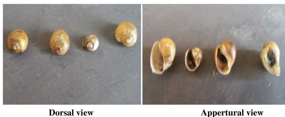
Figure 2. Shell of Bulinus snails (collected at Alwero Dam reservoir, Ethiopia).