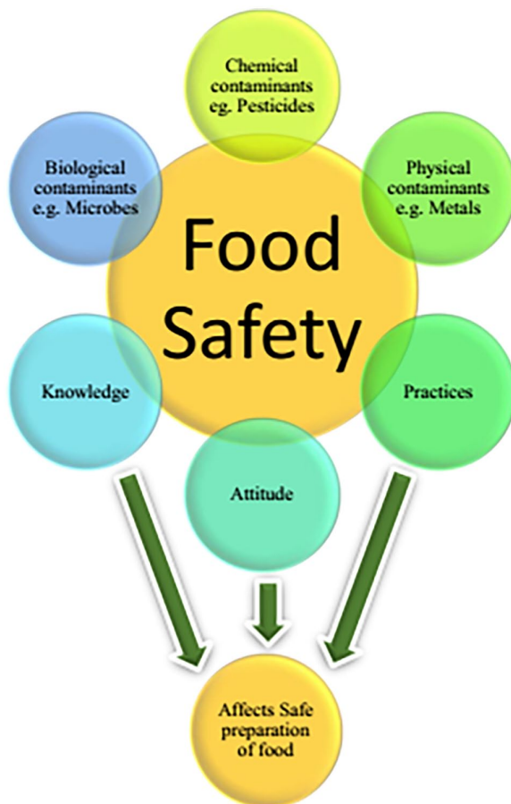
Figure 2. Factors that determine the safety of foods.

caffeine to most drinks or caffeine substances to boost alertness in consumers. 69 Some food handlers also have very poor personal hygiene, poor environmental sanitation, and prepare food in contaminated environments, shocked gutters, and other