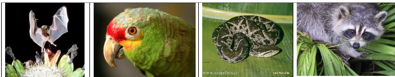
Fig. 3. Examples of four groups of vertebrates (bats, birds, snakes, and non-flying mammals), present in the region of Cuetzalan, and that constituted the focus of the interviews. From left to right, photos correspond to the following species: lesser long-nosed bat ( Leptonycteris curasoae ), red-lored amazon ( Amazona autumnalis ), fer-de-lance snake ( Bothrops asper ), raccoon ( Procyon lotor ).

We chose to interview only male farmers for two reasons: (1) because coffee-growing is a male-dominated activity in this region, and (2) to avoid having another factor (in this case gender) affecting the responses. To gain a detailed understanding of the attitudes, perceptions, and knowledge of farmers we chose to use a method of qualitative research. Consequently, sample size (36) was restricted due to the in-depth nature of the interview applied to each farmer. Each interview was conducted in an oral (both Spanish and Nahua languages were used) and personal way, and lasted 1 to 2 hours. A pilot interview was conducted to make sure that all questions were clearly understood. Interviews consisted of 29 questions, some of which had sub-questions (Appendix 1). Though classification of animals and plants can vary according to culture and language, it became certain during the interviews that all farmers were referring to the same animal groups in their responses as were the interviewers in their questions, namely "birds", "bats," and snakes" (Fig. 3). In the case of non-flying mammals, the photos of individual species were used to ensure the correct identification of species.