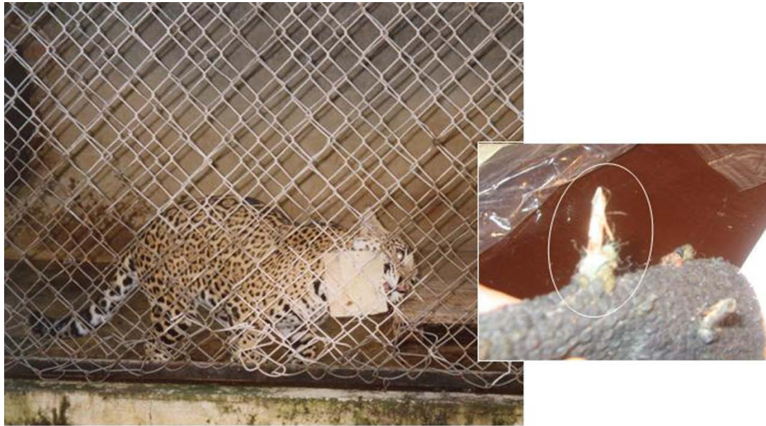
Fig. 2. (a) A jaguar ( Panthera onca ) rubbing against the hairsnare baited with lures at the Tuxtla Gutierrez Zoo in Chiapas; (b) a hair sample obtained from the same jaguar.

(n=1), and jaguarundi (n=1). Other species identified using the hair snares were gray fox ( Urocyon cinereoargenteus , n=1), tayra ( Eira barbara , n=3), coati ( Nasua narica , n=1), four-eyed opossum ( Metachirus nudicaudatus , n=6), and common opossum ( Didelphis marsupialis , n=16). Eight samples were of unknown identity and two samples contained evidence of Mustelids. However, these were excluded due to the low confidence in identification.