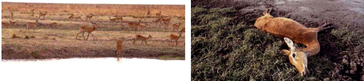
Fig. 1. Left: Large mammals symbolize the wealth of Africa’s PAs. The reasons for their rapid decline are still not well understood, and should therefore be an issue of major concern and subsequent action. Kob antelope at a waterhole in Waza NP (Cameroon). Right: Dead Kob: Following upstream dam construction, the Kob antelope population in Waza NP crashed from 20,000 to 5,000. Subsequent poaching and competition with livestock has led to further declines.

Craigie et al. [6] recently provided a first continent-wide assessment, suggesting a 59% decline in large mammal population abundance in Africa’s PAs between 1970 and 2005, with declines in eastern Africa (52%), a collapse in western Africa (85%), and a surprising 24% increase in southern Africa. Their study also represents a major step forward in quantifying the decline on a regional basis, but falls short in its sampling and analysis. This hinders its ability to help with our understanding of to what extent the observed decline can be attributed to natural fluctuations or human influence, as well as a breakdown of the latter. It does not help that the authors decided to analyze their findings separately, drawing on parallel datasets. In this article, a reaction to Craigie et al. [6] is presented, and a way out of the “black box” of large mammal declines in Africa’s PAs is formulated, with particular attention paid to the generally neglected regions of West and Central Africa. The aim is to provide a useful point of reference for a more comprehensive review of large mammal assessments in Africa’s PAs.