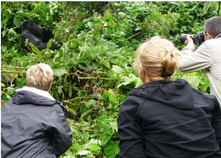
Fig. 3. The habituated mountain gorilla is at the basis of a multimillion dollar tourism industry (Volcanoes NP, Rwanda). The future of Africa's large mammals depends on such economic rationalities. Inevitably, this will "domesticate" Africa's natural environment.