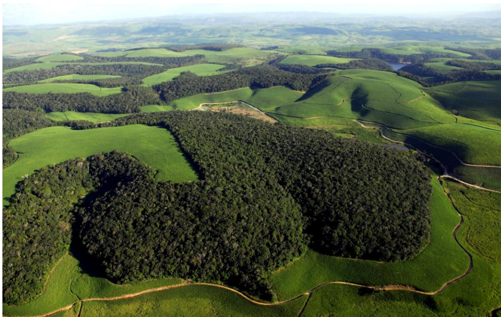
Fig. 2. A typical scenario in the Atlantic Forest at the Northeastern Biodiversity Corridor, where forest remnants are surrounded by sugarcane plantations. Most of the remaining forest fragments are, on average, smaller than 100 ha.

almost all forest remnants in this Atlantic Forest section belong to private landowners, mainly sugar and ethanol refineries. These remnants have been already mapped and classified as irreplaceable sites for biodiversity conservation [31]. Some forest remnants in refinery areas harbor more extinction-threatened birds and mammals than the reserves of the region [30]. Hence, it is absolutely necessary to find solutions to conciliate the socioeconomic development potential resulting from the expansion of sugarcane and the conservation of the biodiversity of those areas.