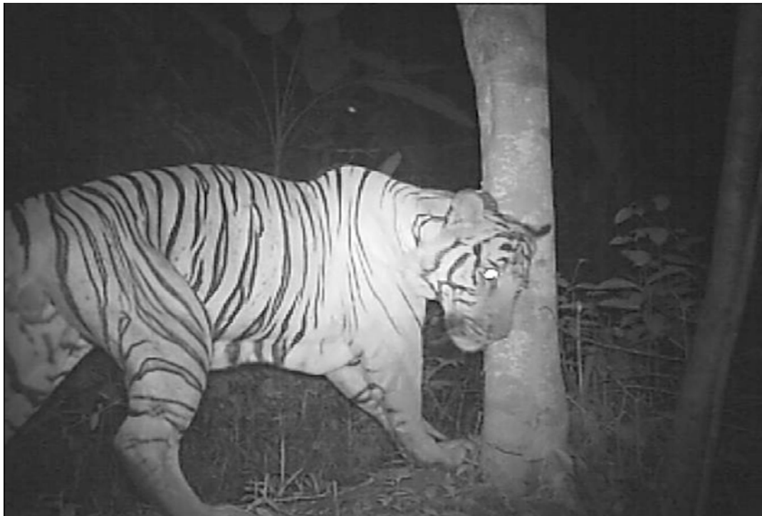
Fig. 3. An adult male tiger ‘cheek rubbing’ on one of the hair traps in the study.