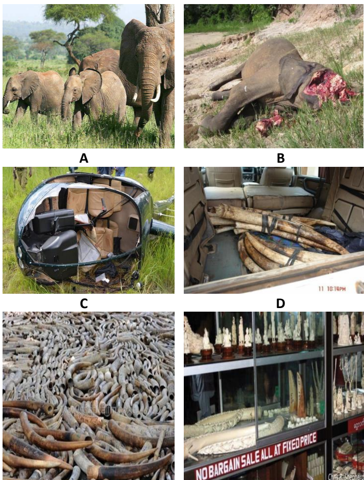
Fig. 1 A): Elephants – one of iconic and keystone species found in Tanzania, B): An elephant killed for its ivory, C): The aircraft crashed while it was tracking a group of elephant poachers near the Maswa Game Reserve, Tanzania, D): Ivory found in a car in Dar es Salaam, E): Ivory from poached elephants, F): Items made of elephant tusks displayed in a shop in China

Elephant poaching and the illicit ivory trade rank among the topmost wildlife crimes globally (5-8). The factors driving this crime include a rapid growth in the demand for ivory in Asian countries for fashion and medicinal purposes [5, 6], and unemployment, widespread poverty and corruption in the supply countries [7, 8]. The illicit ivory trade is a low risk and high profit undertaking, and is one of the main reasons making wildlife crime rank fourth after drugs, arms and human trafficking [9, 10]. The global trade of illegal wildlife is estimated to generate between US$8 billion and US$10 billion per annum [9, 10]. Because the demand for ivory has skyrocketed in recent years, its price in consumer countries has increased exponentially. For example, demand in China has tripled the price of ivory in just four years from US$750/kg in 2010 to USD$2,100/kg in 2014 [11]. High prices stimulate supply and result in increased elephant poaching in the origin countries, where economic and social problems such as poverty, population growth, unemployment, insecurity and corruption are widespread.