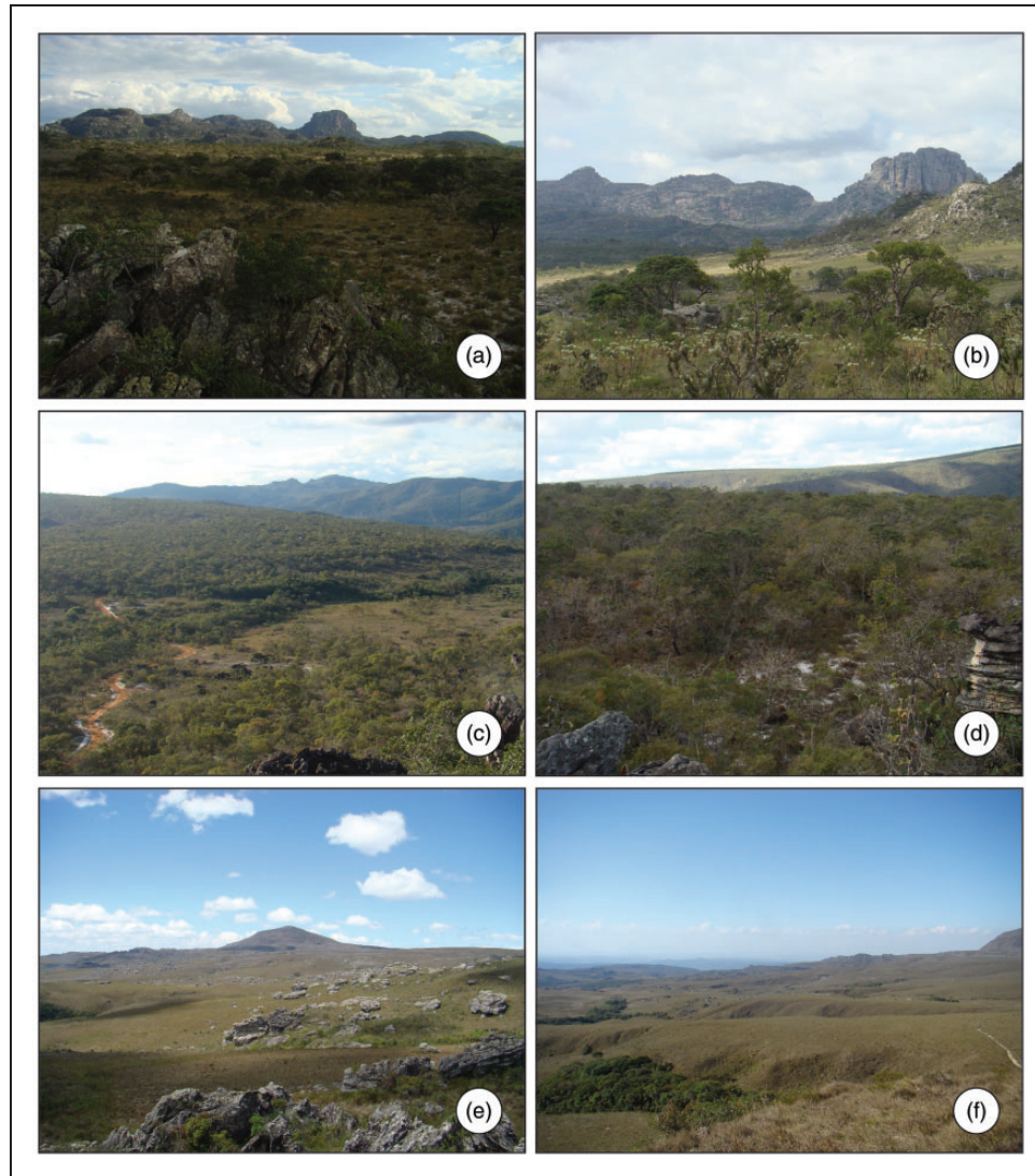
Figure 2. Habitats in the Diamantina Plateau. (a and b) Sempre Vivas National Park, RAPELD module area PNSV I with campos rupestres and cerrado savannas; (c and d) Rio Preto State Park, RAPELD module area PERP I with campos rupestres, cerrado savannas, and transitional areas; (e and f) Rio Preto State Park, RAPELD module area PERP II with campos rupestres and gallery forests.

surrogate of functional diversity, a highly informative biodiversity metric (Gallardo, Gascón, Quintana, & Comín, 2011). Asteraceae genera have been used to evaluate the efficiency of the conservation unit network in Mexico (Villaseñor, Ibarra, & Ocaña, 1998).