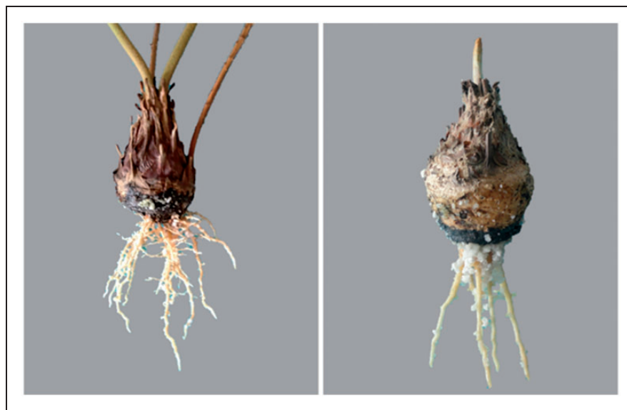
Figure 1. (A) Zamia furfuracea stem cutting displaying healthy adventitious roots 52 days after preparation. Leaf growth occurred prior to root growth (B) Zamia integrifolia stem cutting displaying healthy adventitious roots and simultaneous leaf growth 58 days after preparation.