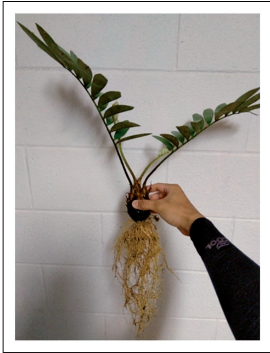
Figure 2. Zamia furfuracea stem cutting after 8 months of growth.

survivability that is achievable when propagating cycad plants asexually. Regardless of treatment, a mean of 96% of stem cuttings produced healthy adventitious root systems and leaves by the end of both studies (Figure 2). Successful asexual propagation of cycads is possible when hygienic conditions are adhered to, stem cuttings are obtained from healthy plants (Marler, 2018), a fungicide mixture such as flowers of sulfur and Bordeaux is applied to the cut surfaces (Tang, 1985), a sealant is used to cover cut surfaces to prevent desiccation (Marler et al., 2020), the medium demonstrates adequate aeration and drainage capacity, and underwatering is used during the propagation phase (Whitelock, 2002).