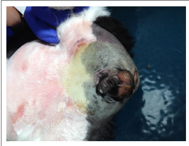
Figure 1 Day 4 post-presentation of case 1 illustrates the first indication of necrotic skin formation as seen by the yellow–gray skin discoloration that extends 5 cm cranial to the prepuce, 1 cm lateral to the scrotum and prepuce, and extends toward the lateral and caudal margins of the tail base. A tissue marker was used to outline the delineation between normal and abnormal skin for the purposes of monitoring for further progression