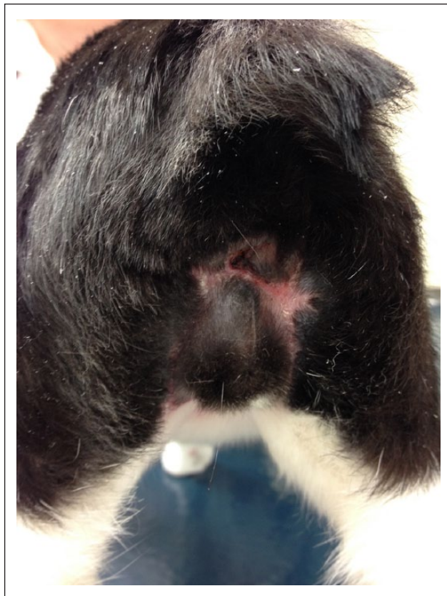
Figure 4 Day 57 post-presentation of case 1 illustrates complete wound healing, at which time normal anal tone was present and the fecal incontinence had resolved. The cat was neutered 2 weeks later

USA, for an evaluation of acute-onset vomiting, tenesmus and lethargy. The cat's diet consisted of Nutro Natural Choice adult dry cat food, with the canned variety occasionally added in. Examination revealed the cat had a slightly elevated temperature ( 39.3^{\circ}\text{C} ), with tacky mucous membranes and tachycardia (230 bpm). Upon palpating the abdomen, tenesmus was induced with only a clear mucoid discharge produced. The bladder palpated soft and small, and a rectal examination revealed an empty colon with clear mucous on the glove.