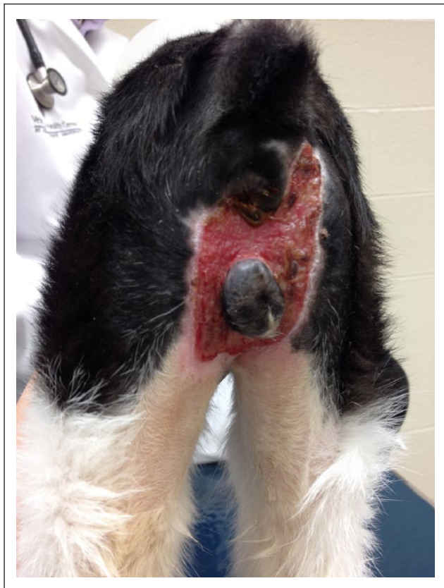
Figure 3 Day 30 post-presentation of case 1. The necrotic tissue has completely sloughed on its own, revealing significant wound contraction and presence of granulation tissue