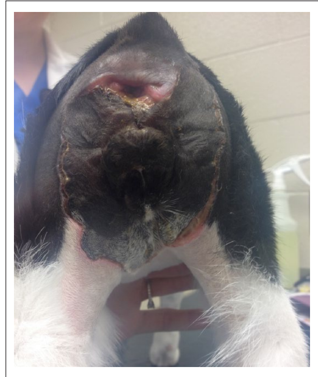
Figure 2 Day 11 post-presentation of case 1 illustrates the extent of the necrotic lesion, with the wound edges pulling away from the underlying tissue. The necrotic skin was left in place to protect the underlying tissue from fecal contamination

and the cat was more active and began to eat. Cellulitis was noted on the caudal ventral abdomen extending around the prepuce, scrotum and rectum, and significant pain was elicited when palpating the lumbar–sacral spine. A repeat CBC revealed an improved total WBC, with neutropenia and elevated bands with moderate toxic changes in neutrophils (see Table 1). Significant abnormalities on serum biochemistry revealed a persistent hypoproteinemia, hypoalbuminemia, increased creatine kinase and hyperbilirubinemia (Table 2).