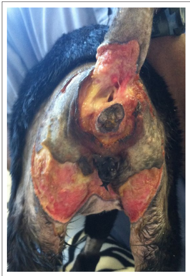
Figure 5 Day 18 post-presentation of case 2 illustrates the extent of the wound at its worse. The necrotic tissue has started to slough, with a portion of necrotic skin still present

A CBC revealed resolution of leukopenia and thrombocytopenia (see Table 5), and serum biochemistry was unremarkable (see Table 6). The previously prescribed therapy (buprenorphine and amoxicillin/clavulanic acid) was continued for an additional 2 weeks, and the cat began cold laser therapy of the wound the following day.