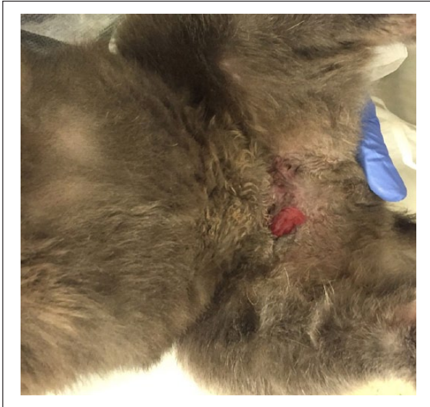
Figure 6 Inguinal area 3 months after hospitalization (January 2016)

changes in both the inguinal area and the right lateral thigh every 2–3 days. Thirty days after admission, the wounds were closed in a staged manner involving two separate surgeries spaced 2 weeks apart. After hospitalization for 50 days, vancomycin was discontinued and the cat was discharged on oral pradofloxacin.