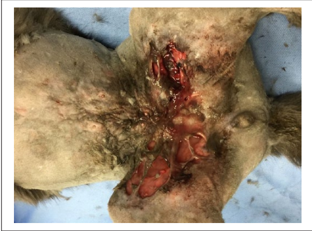
Figure 1 Inguinal region at time of hospitalization (October 2015) and prior to wound debridement

to the Veterinary Medical Teaching Hospital (VMTH) for wound care due to progression of lesions. On physical examination, the cat was alert and responsive and in good body condition (score 5/9) with normal vital signs. The cat was non-ambulatory and assessed to be painful in the pelvic limbs. Within the inguinal region there were deep skin wounds that were 25 cm × 15 cm. A large amount of purulent exudate discharged from the wounds. An ulcerated, 10 cm × 5 cm lesion with exudate and crusts was present on the lateral aspect of the right thigh.