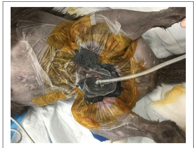
Figure 3 Vacuum-assisted wound closure device applied after wound debridement (October 2015)

stain. Tissue PCR for a M tuberculosis-bovis complex (MTBC) organism was weakly positive after 40 cycles of PCR (cycle threshold [CT] values 36.57 for Mycobacterium species DNA and 20.91 for the housekeeping gene, with values <40 being positive). This assay detects the rpoB gene of M bovis , Mycobacterium caprae , M tuberculosis and M microti .