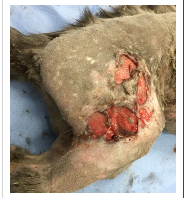
Figure 2 Right lateral thigh at time of hospitalization (October 2015) and prior to wound debridement

Histopathologic examination of a punch biopsy (6 mm in diameter) again revealed severe, chronic, multifocal, pyogranulomatous dermatitis and panniculitis and granulomatous lymphangitis (Figures 4 and 5). No infectious organisms were identified after staining with Ziehl–Neelsen acid-fast stain, Giemsa, Brown and Brenn gram stain and Grocott–Gomori's methenamine silver