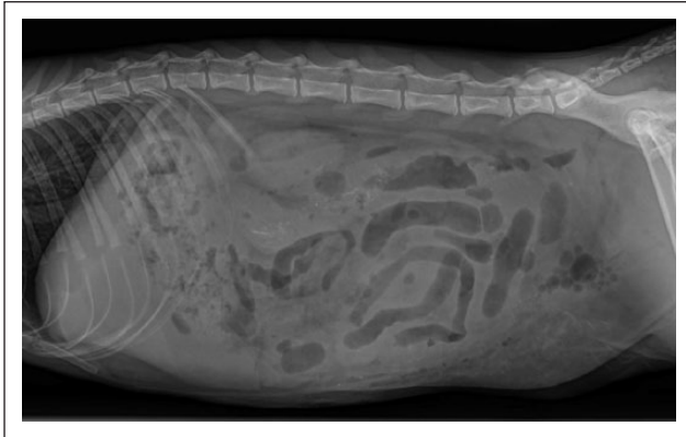
Figure 2 Abdominal radiograph showing a loss of abdominal detail and small round gas opacities suggestive of intestinal perforation and septic peritonitis

lavaged with sterile saline (0.9% NaCl Solution; Abbott Laboratories) and the abdominal cavity was dried using laparotomy sponges before routine closure using 3-0 polydioxanone suture in a simple continuous pattern to close the linea and 3-0 poliglecaprone suture in a buried intradermal pattern to close the skin (Monocryl; Ethicon).