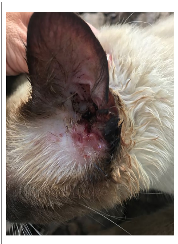
Figure 1 External meatus of the cat with ulceration, erythema and a dark secretion

After the cytopathological examination revealed the presence of yeast-like structures, an oral antifungal