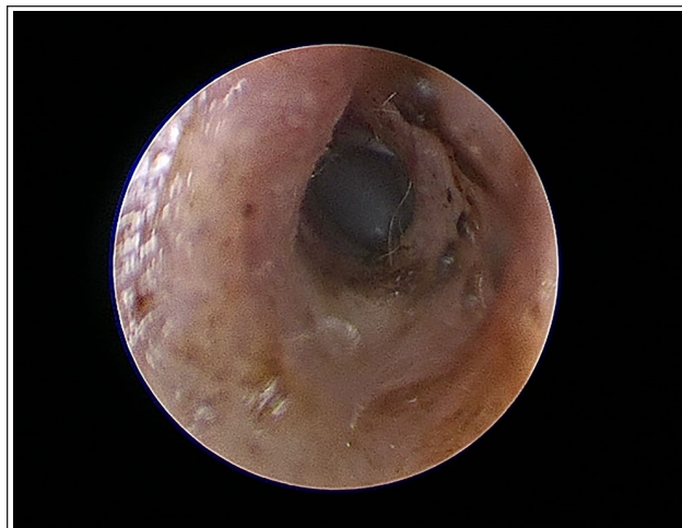
Figure 1 Video-otoscopic image of the right external ear canal showing otitis externa characterized by excessive cerumen and erythema of the canal wall

Treatment consisted only of sarolaner (5mg)/selamectin (30mg) topical solution (Revolution Plus; Zoetis) applied once monthly to the skin of the dorsal