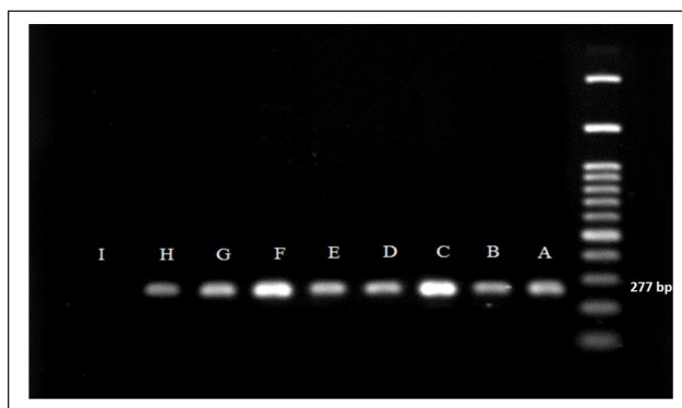
Figure 1 Agarose gel electrophoresis stained by ethidium bromide producing 277 base pair fragments for PKD1 mutant genes (A and B = positive control; C to H = PKD1 mutant genes; I = negative control)

Twenty-two cats (46.8%) were diagnosed as heterozygous for the mutant gene by PCR (Figure 1).