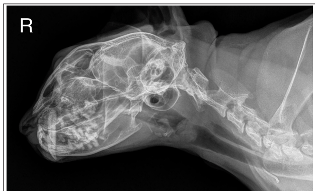
Figure 1 A round, homogeneously soft tissue opaque structure (ie, laryngeal cyst) was appreciated within the larynx on a right lateral radiograph of the head and neck region of the patient.

radiologist, with the pertinent finding of a homogeneously soft tissue opaque structure within the larynx, caudal to the epiglottis, which exhibited rounded cranial and caudal margins (Figure 1). The cat was referred for additional diagnostics and treatment.