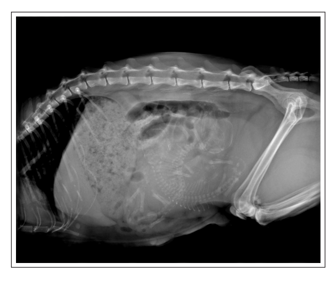
Figure 2 Fetal count radiography 3 days before delivery, revealing the skeleton of two cat fetuses. Ultrasound examination also showed two normal heartbeats

Three days later, the queen gave birth naturally to two kittens without any difficulty, with a time interval