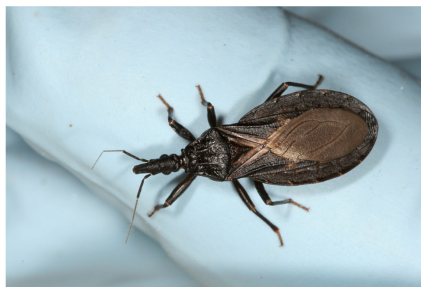
Figure 3. Male Triatoma protracta , another cause of anaphylaxis in California and Arizona.

Aggregation of kissing bugs in hiding refuges appears to be mediated in part by pheromones present in feces 17 and epicuticular hydrocarbons on the bug body. 18 The attraction appears weak and difficult to demonstrate and dependent on the status of individual bugs. Unfed, immature T. infestans were attracted to papers contaminated with feces, whereas recently fed individuals were not attracted. 17 The main attractants in epicuticular lipids are the free fatty acids steric (octadecanoic acid) and, at low concentrations, hexacosanoic acid. At high concentrations, hexacosanoic acid is repellent. 18