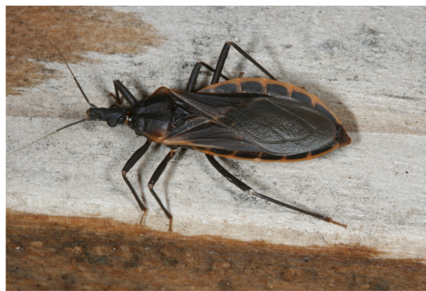
Figure 2. Female Triatoma rubida , a common cause of anaphylaxis in Arizona.

Sexual communication in triatomines remains poorly understood. Sex pheromones are produced in adult metasternal