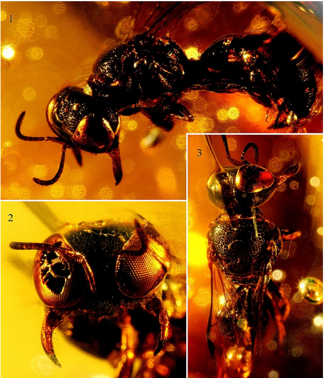
Figs. 1–3. Photomicrographs of holotype female of Lindenius paleomystax , new species (AMNH DR-14-1091). 1. Oblique lateral habitus. 2. Facial aspect. 3. Dorsal aspect.