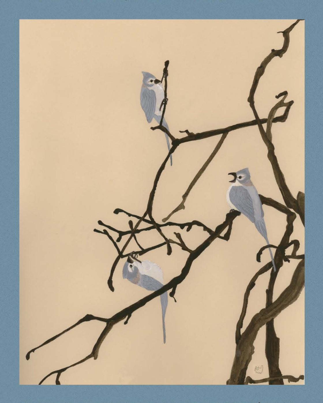
PUBLISHED BY THE AMERICAN ORNITHOLOGISTS' UNION

VOLUME 126, NUMBER 2, APRIL 2009 AN INTERNATIONAL JOURNAL OF ORNITHOLOGY