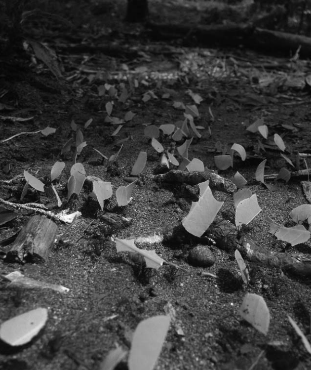
Figure 1. Leafcutter ants: The ultimate superorganism. These Atta colombica workers incessantly carry leaves back to the nest to use as a substrate to grow a mutualistic fungus, which they farm as food for both queen and workers.