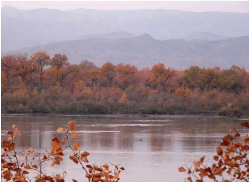
Tigrovaya Balka Nature Reserve is located in Tajikistan close to the Afghan border, where the Vakhsh River (pictured here) flows. Although the Caspian tiger for which the reserve is named is gone, Tigrovaya Balka is still home to the tiger's main prey, the Bukhara deer.

Wherever tugai thrives, it's composed of a gallery of impenetrable thickets entwined with lianas, dotted by patches of grassy clearings, and interspersed with wetlands. Poplar, willow, and tamarisk trees alternate with meadows and reeds. Briar roses and honeysuckles twist through the understory. "If you were flying over tugai," Pereladova says, "you'd see willow and poplar forests almost indistinguishable from meadows and swamps."