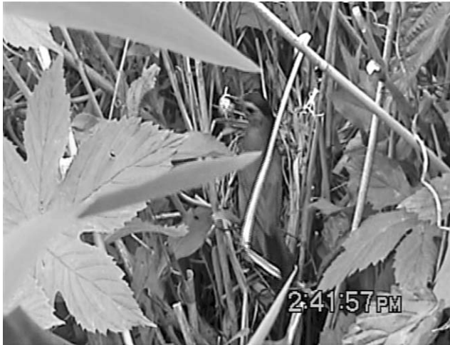
FIGURE 2. Puncture-ejection of a real Brown-headed Cowbird egg by a Gray Catbird.

mixture of ejection methods, whereas the six other species in which ejections have been observed either all grasp-eject or all puncture-eject (Table 1).