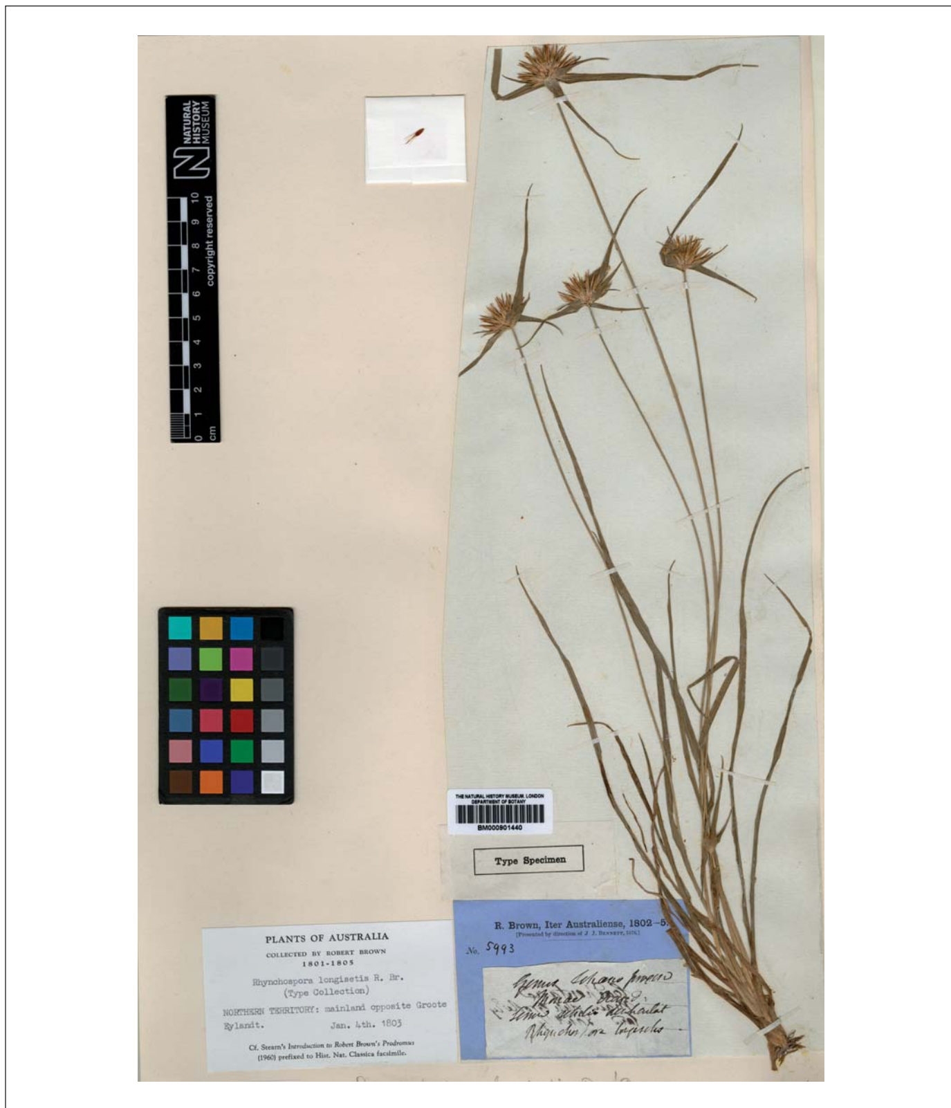
Fig. 2. – Lectotypus of Rhynchospora longisetis R. Br.

[Banks s.n., BM] [© Natural History Museum, London. Reproduced with permission]