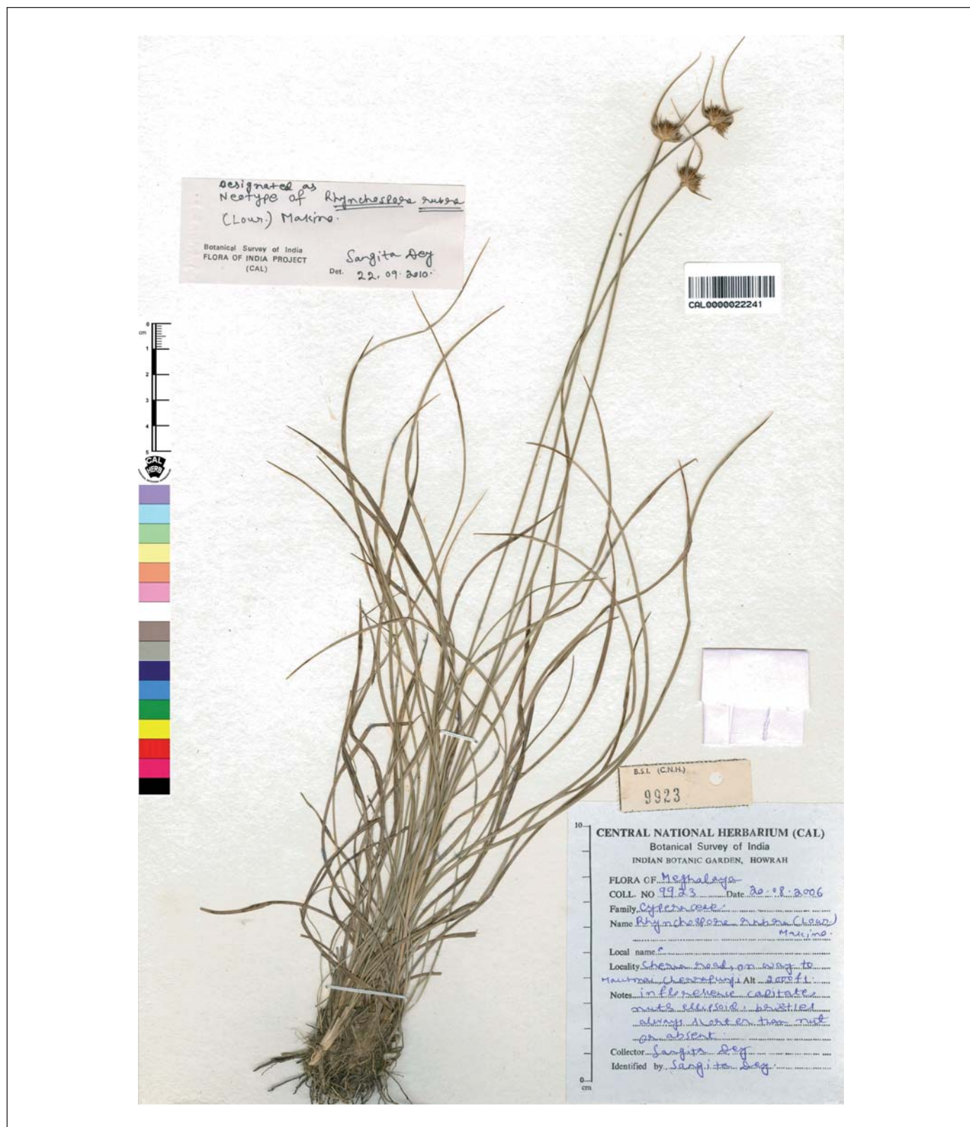
Fig. 3. – Neotypus of Rhynchospora rubra (Lour.) Makino.