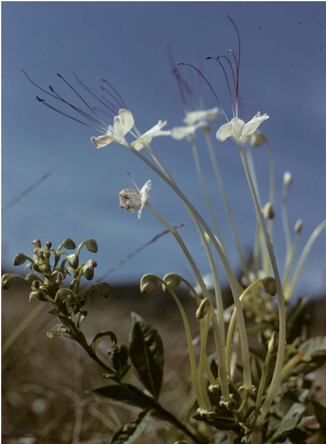
Fig. 2. – Living plant of Rotheca microphylla (Blume) Callm. & Phillipson.