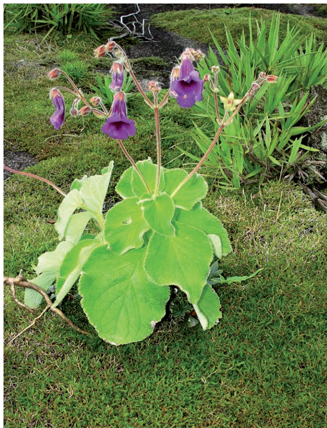
Fig. 2. – Living plant in situ of Sinningia braggae Chautems, M. Peixoto & Rossini.