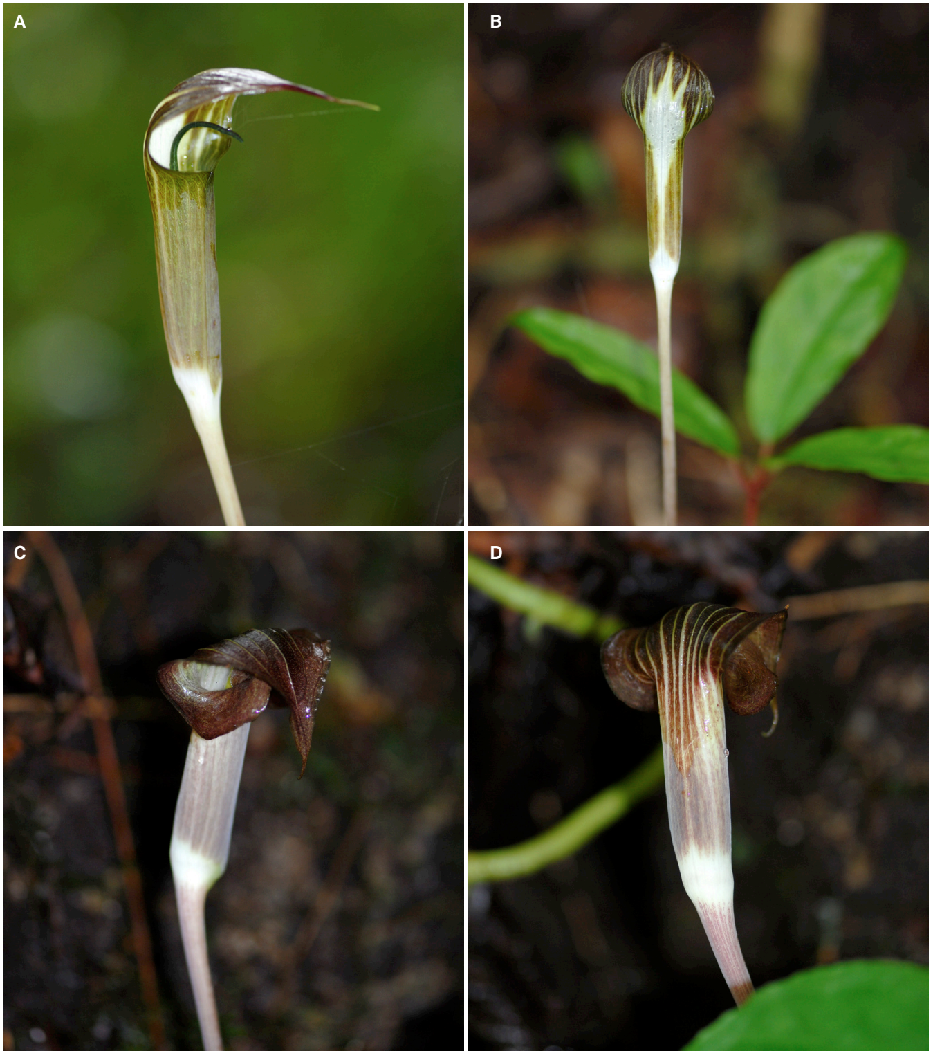
Fig. 2. – Inflorescences of Arisaema brinchangense Y.W. Low, Scherberich & Gusman ( A-B ) and A. anomalum Hemsl. ( C-D ). A. Side view of the inflorescence showing straight and hardly recurved spathe-tube mouth margin; B. Dorsal view of the inflorescence showing distinct white to pale cream coloured trident marking (with three pointed tips) on the spathe-limb; C. Side view of an inflorescence showing strongly recurved (auriculate) spathe-tube mouth margin; D. Dorsal view of the inflorescence showing white to pale cream coloured narrow parallel stripes along the spathe-limb.