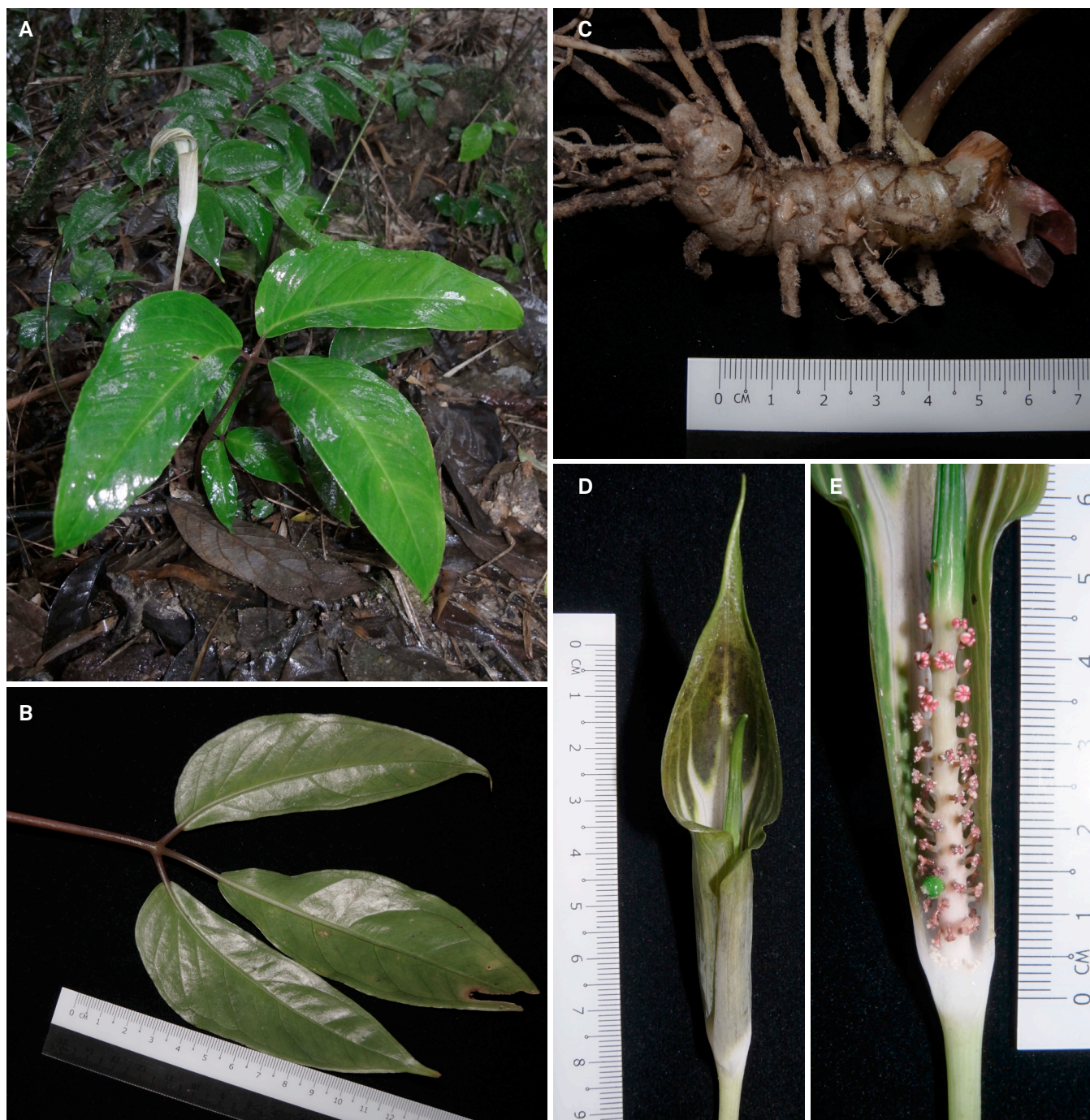
Fig. 1. – Arisaema brinchangense Y.W. Low, Scherberich & Gusman. A. Habit; B. Details of the lower leaf blade surface; C. Rhizome showing numerous offsets and fleshy white roots, inflorescence artificially removed; D. Front view of an inflorescence showing spathe-limb with distinctive white trident marking (with three pointed tips) and spadix-appendix slight bent forward; E. Spathe-tube of a male inflorescence artificially removed to show the male spadix fertile zone, note pollen accumulated at the base of the tube. [Low & Low-Edwin LYW 520, SING]