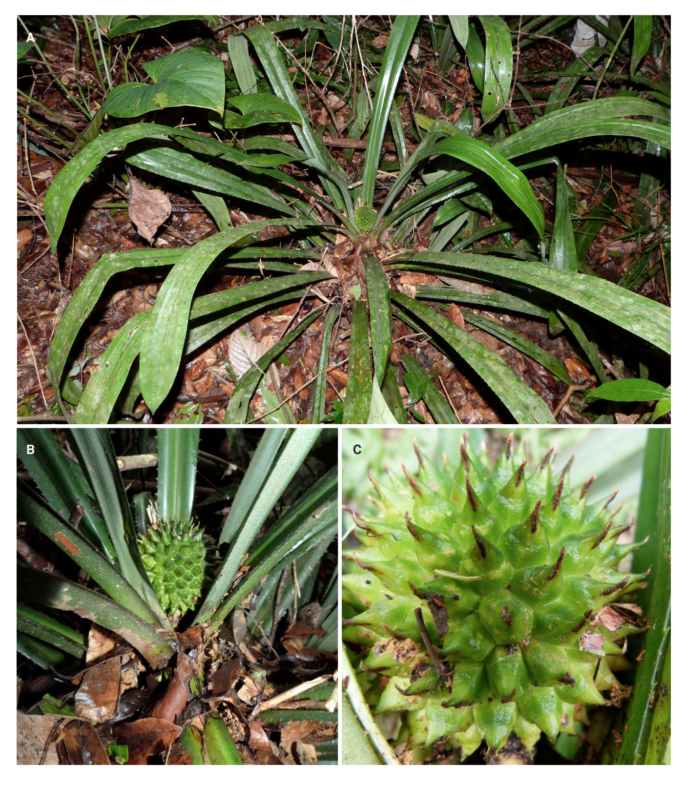
Fig. 2. – Benstonea fortuita Callm. & Buerki. A. Habit; B. Infructescence; C. Close up of styles and stigmas. [Callmander et al. 1197]