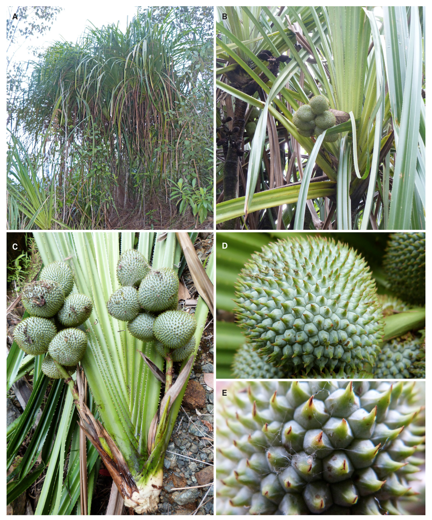
Fig. 3. – Benstonea serpentinica Callm. & Buerki. A. Habit; B-C. Infructescences; D. Syncarp; E. Close up of styles and stigmas. [A-B: Buerki et al. 342; C-D: Callmander et al. 1187]