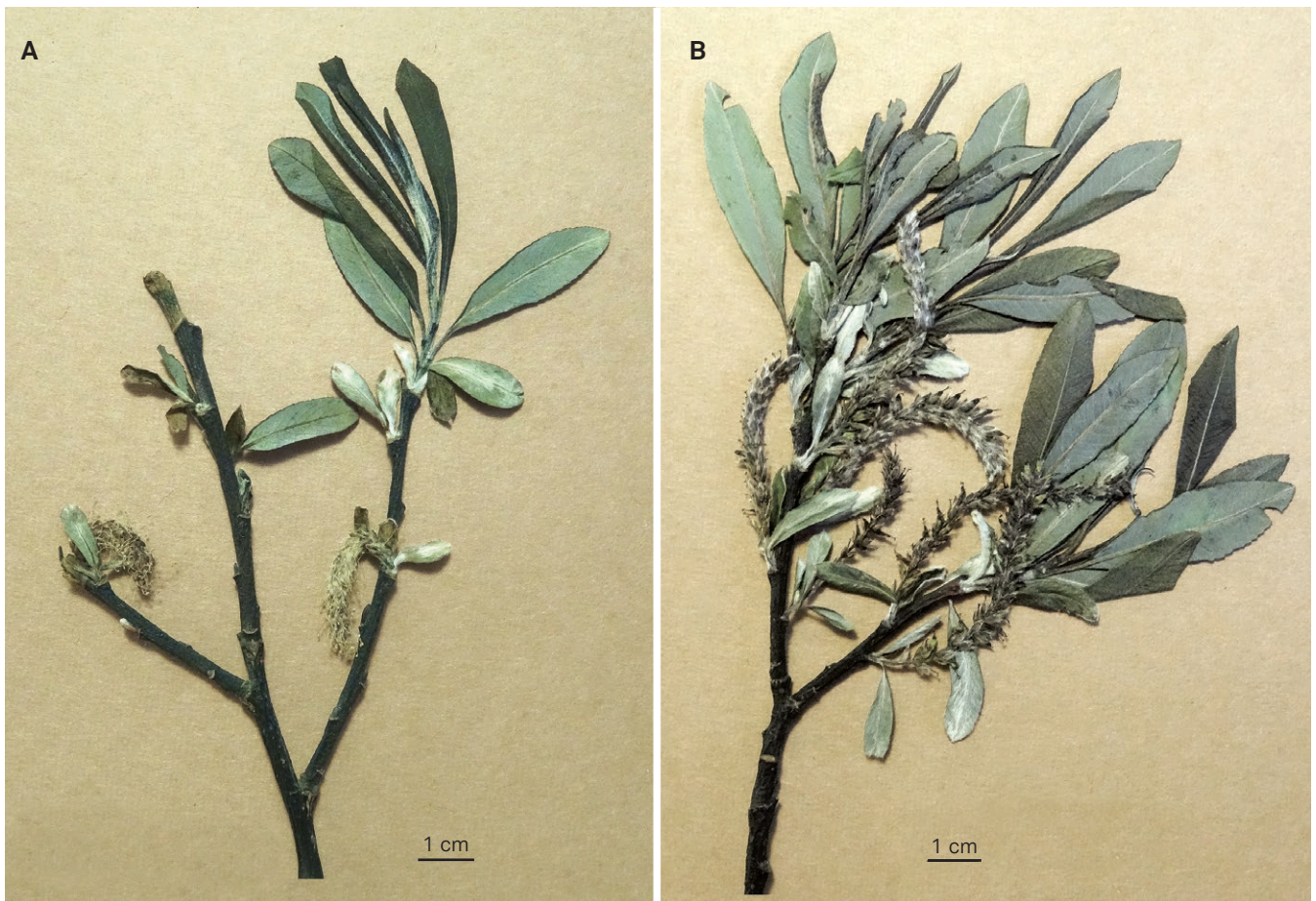
Fig. 1. – Salix ×marchettii M. Merli & F. Mart. A. Male specimen. B. Female specimen.

between those of the parents, but in S. ×marchettii the veins appear prominent only below, as in S. eleagnos . The silky indumentum of the lower leaf blade and petiole recalls mainly S. crataegifolia and, as in the latter, is very dense in immature leaves. This indumentum persists on leaves when mature only on the midrib or is completely deciduous. The leaf petiole is usually more developed than in S. eleagnos . The heritage of S. eleagnos appears better defined in male catkins, whose sizes are intermediate between those of the parents, but the filaments are connate, as in S. eleagnos , for at least half their length or more (Fig. 2B). The development of female catkins recalls, in form and posture, that of S. crataegifolia , but, in the observations so far, the capsules were sterile. The floral bracts are similar in shape to those of S. crataegifolia , usually completely brownish, at first silky then glabrous or nearly so.