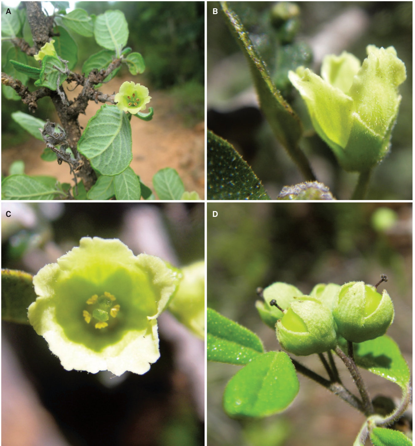
Fig. 1. – Bouyeria scabra Thulin & Razafim. A. Flowering branch; B. Flower; C. Inside of flower, showing anthers and tip of style; D. Fruits. [A: Ravelonarivo 4630; B, C: Ratovoson 1592; D: Ratovoson 1508]