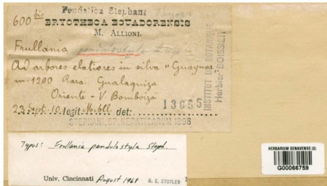
Fig. 2. – Label of holotype of Frullania pendulostyla Steph. at G.

only in 1953. Allioni's labels therefore frequently mention Azuay as province of origin of the specimen, instead of Morona Santiago. The only collections made by Allioni in Azuay, as currently defined, are from Chunchi and Cuenca, gathered in January 1909 while travelling from Guayaquil to Gualaquiza, and from the páramo of Matanga near the provincial border with Morona Santiago, visited by Allioni in October 1909 and again in November 1910.