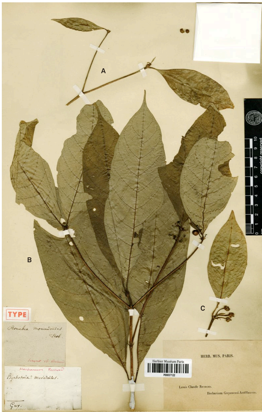
Fig. 1. – Type material of Ronabea morindoides A. Rich. A. Eumachia guianensis (Bremek.) Delprete & J.H. Kirkbr.; B–C. Lectotype of Ronabea morindoides A. Rich. ( \equiv Appunia morindoides (A. Rich.) Delprete, C.M. Taylor & T. McDowell). [P00837122]