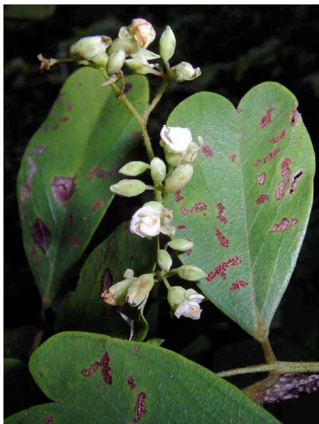
Fig. 6. – Dalbergia obcordata N. Wilding, Phillipson & Cramer. Inflorescence and leaflets. [Gautier et al. 4567]

Notes. – Phylogenomic and population genomic results (CRAMERI, 2020) support the recognition of Dalbergia obcordata as a distinct species and point to only a distant