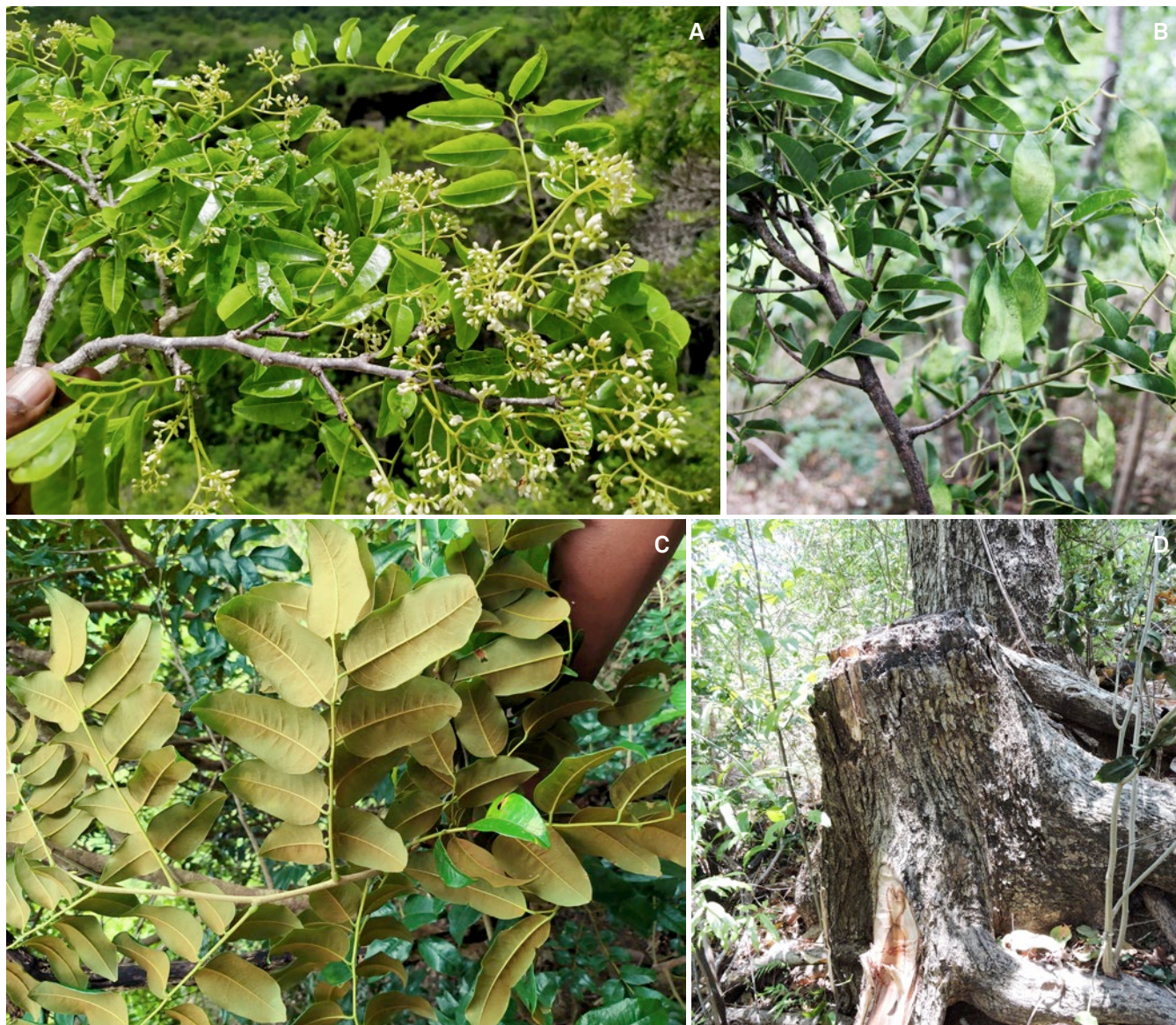
Fig. 2. – Dalbergia antsirananae Phillipson, Cramer & N. Wilding. A. Flowering branch; B. Fruiting branch; C: Leafy branch from coppice shoot, showing underside of leaves with distinctive pale brown indument on the laminae, contrasting with leaves on fertile branches; D: Bole of large felled tree (foreground) and large standing tree (background).

[A: Randrianaivo 3675; B: Razafitsalama1504; C–D: Randrianaivo 3506]