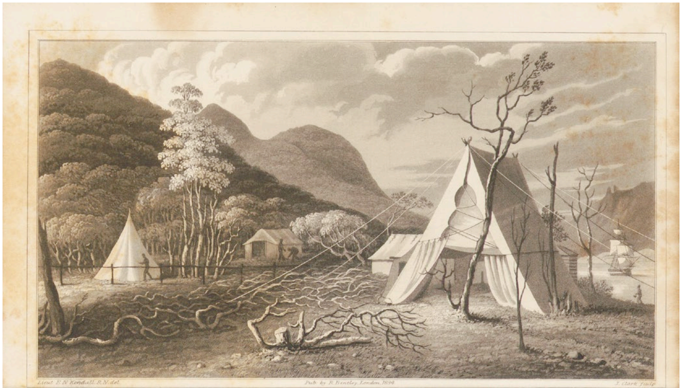
Fig. 2. – Pendulum Station at Port Cook, Staten Island. [WEBSTER, 1834a: 99]

be appointed to serve with the expedition in the character of botanical collector, whose exclusive duty it shall be to procure and preserve botanical specimens and seeds, and whose collections shall from time to time be delivered to the care of the commanding officer, to be transmitted to England as occasion may occur” (WEBSTER, 1834b: 380). And it continued as follows: “That Mr. Webster, the surgeon of the ship, be directed to attend to the collection and preservation of specimens in zoology, mineralogy, and geology united; and the Committee will hold themselves in readiness to furnish to Mr. Webster and to the botanical collector, such further instructions in detail as may be required” (WEBSTER, 1834b: 380–381). The presumed botanical collector is not afterwards mentioned by Webster in his account, which makes one think that Webster himself was who finally held such responsibility. In fact, the botanical specimens originated from this expedition were attributed to him and housed in K. This second statement is not mentioned in Webster’s account but becomes logical knowing the royal nature of the expedition. Moreover, Webster’s specimens are mentioned several times in the later Flora Antartica by Joseph D. Hooker (1817–1911), who developed most of his career in Kew.