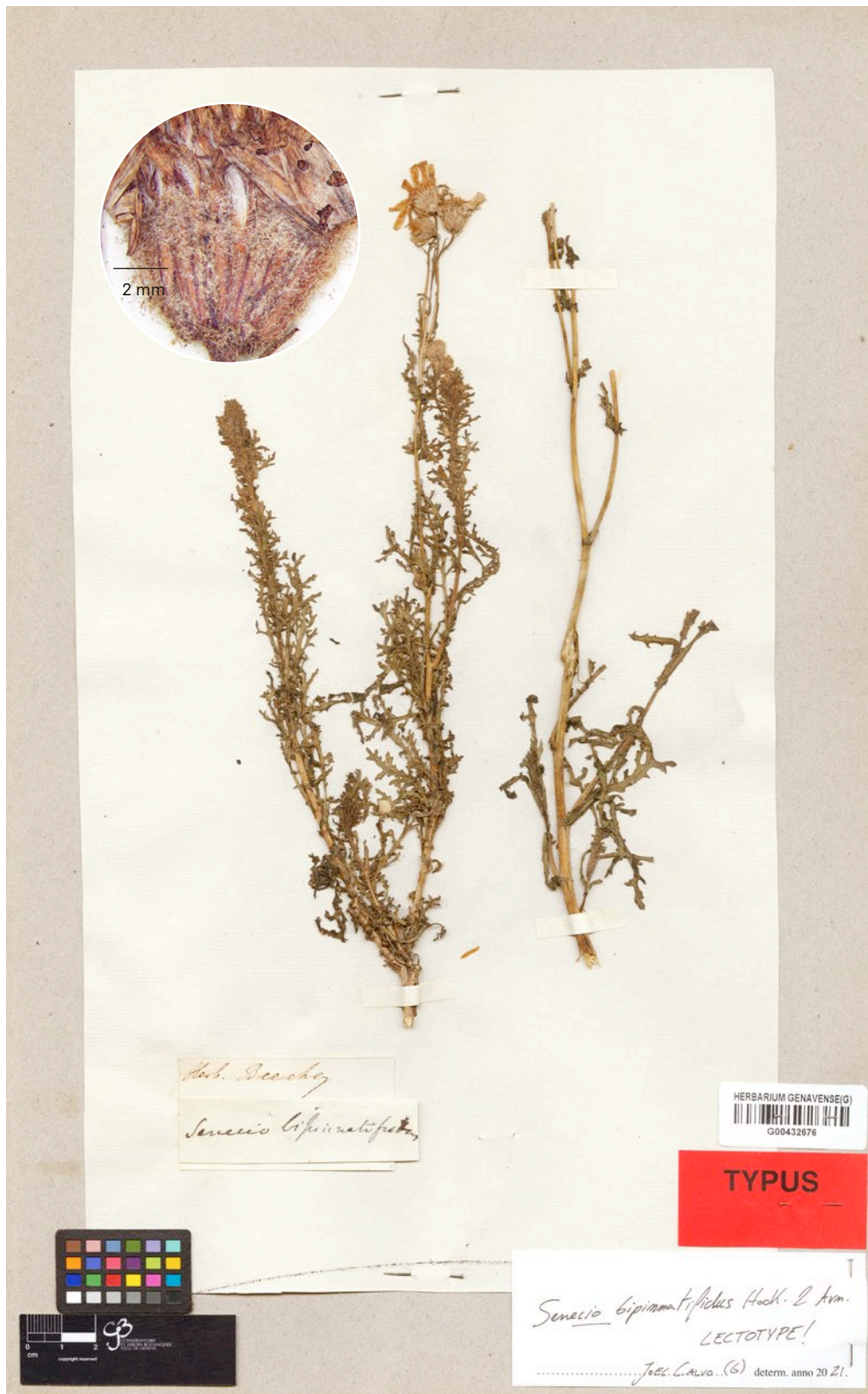
Fig. 1. – Lectotype of Senecio bipinnatifidus Hook. & Arn. [G00432676; Conservatoire et Jardin botaniques de Genève]