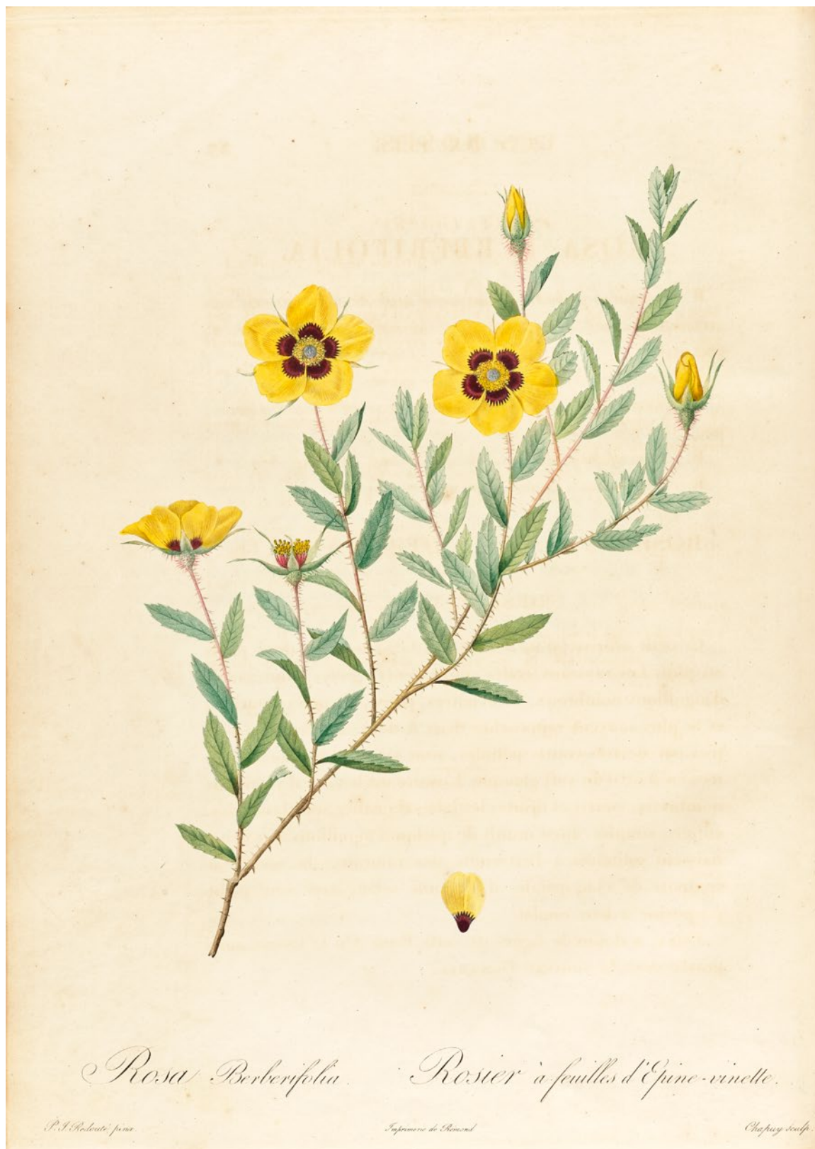
Fig. 4. – Colour stipple engraving based of Pierre-Joseph Redouté of Rosa persica J.F. Gmel. [Redouté, P.-J., Les Roses , Paris, 1817]