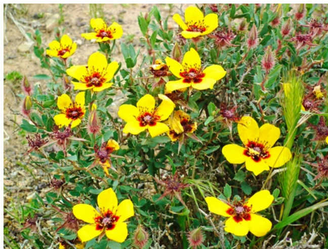
Fig. 1. – Rosa persica J.F. Gmel.

The first westerner to collect a specimen of Rosa persica was André Michaux (1746–1802), a correspondent of the Jardin du Roi and the Cabinet du Roi in Paris. He had applied in writing to Marie-Antoinette (1755–1793), Queen of France,