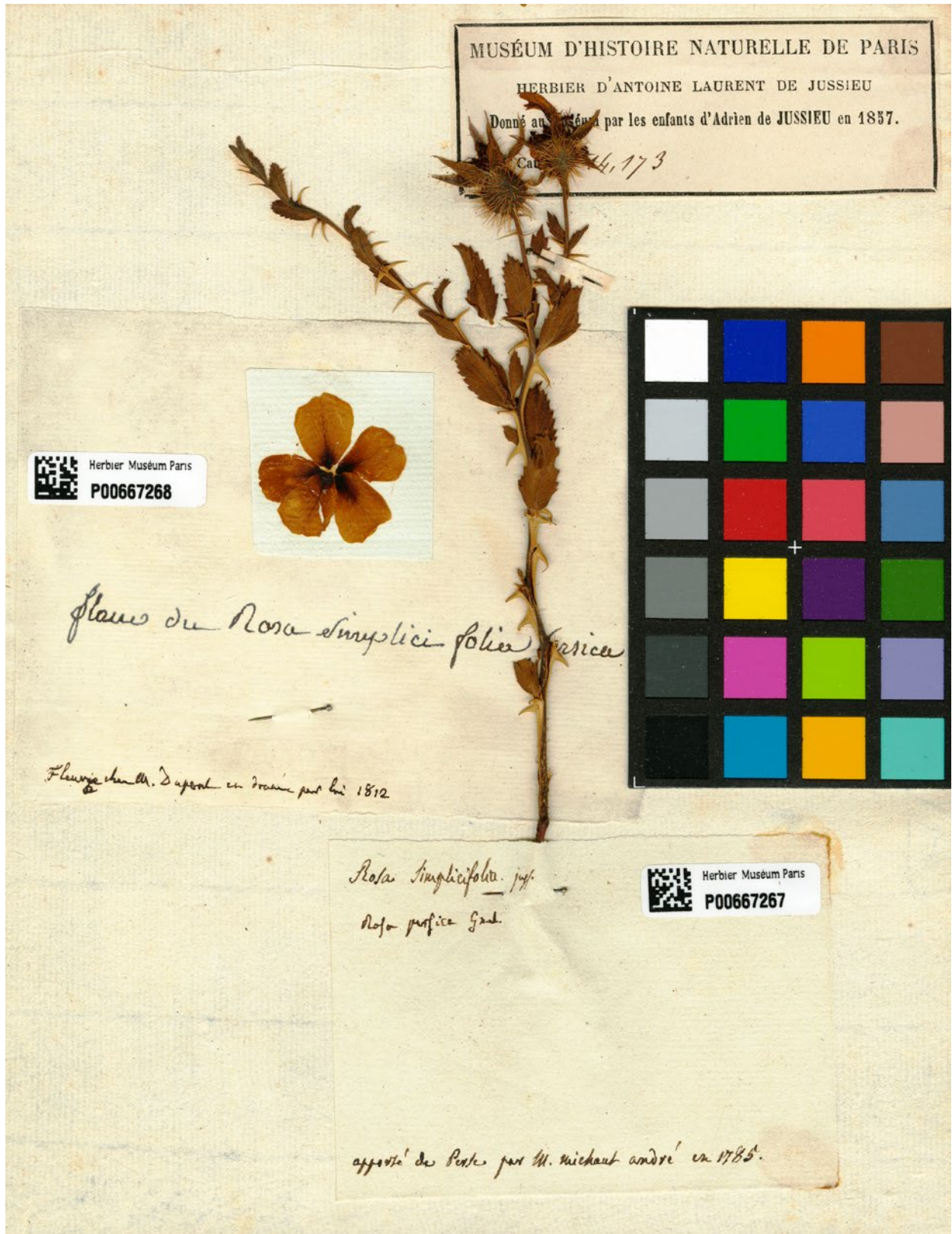
Fig. 2. – Neotype of Rosa persica J.F. Gmel. [Michaux s.n., P-JU n° 14173 (P00667267)]