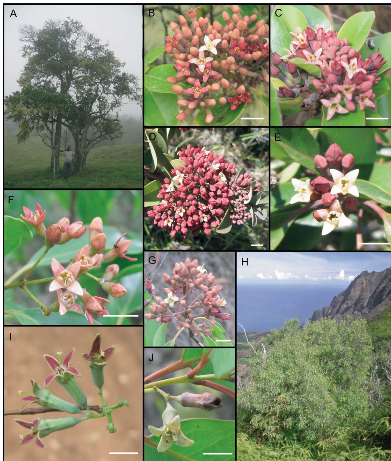
FIG. 3. A-B. Santalum haleakalae var. lanaiense, Auwahi Preserve, E. Maui. C. S. haleakalae var. lanaiense, Kanepu'u Preserve, Lana'i. D. S. haleakalae var. haleakalae, Haleakala National Park, E. Maui. E. S. haleakalae var. lanaiense, Kamakou Preserve, Moloka'i. F. S. freycinetianum Ko'olau Mts., O'ahu. G. S. freycinetianum, Wai'nae Mts., O'ahu. H. S. involutum, above Kalalau Valley, Kaua'i. I. S. pyrularium, Na Pali Kona Forest Reserve, Kaua'i. J. S. pyrularium, Waimea Canyon State Park. White scale bars (photos B-G and I-J) = 7 mm.