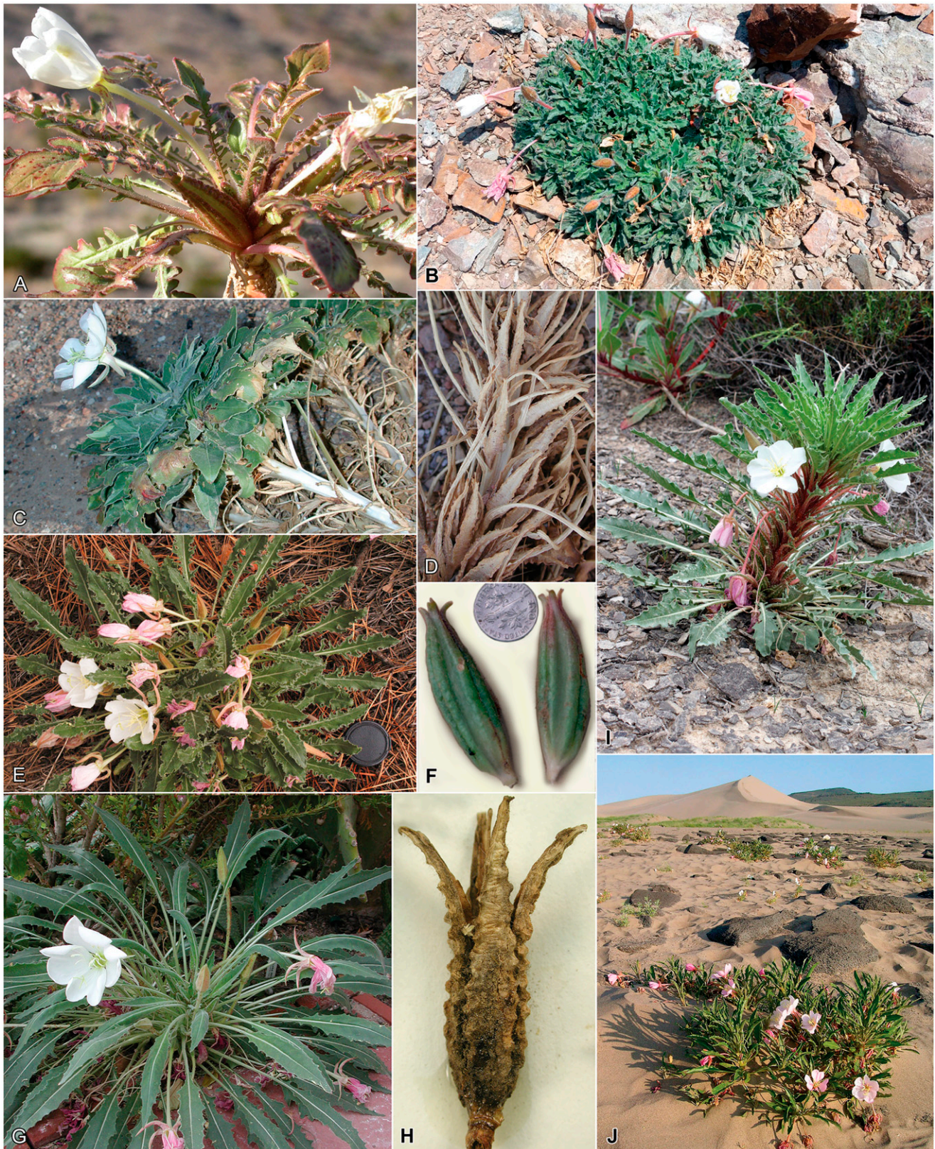
FIG. 1. Oenothera sect. Pachylophus. A. Oenothera cavernae. Habit with flower and immature capsule. Lincoln Co., Nevada. B. Oenothera cespitosa subsp. crinita. Habit with flower. Inyo Co., California. C–D. Oenothera cespitosa subsp. navajojensis. Emery Co., Utah. C. Stem with leaves, flower, and dehiscent capsules from previous years. D. Close-up of stem with dehiscent capsules. E–F. Oenothera cespitosa subsp. macroglossis. Boulder Co., Colorado. E. Habit with flowers. F. Immature capsules. G–H. Oenothera cespitosa subsp. marginata. G. Habit with flowers. Pima Co., Arizona. H. Dehiscent capsule. Sandoval Co., New Mexico. I. Oenothera harringtonii. Habit. Fremont Co., Colorado. J. Oenothera psammophila. Habit with flowers. Fremont Co., Idaho.