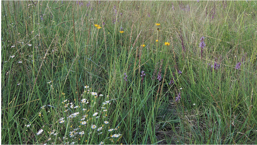
A close look at the Nash Prairie reveals brownseed and Florida paspalum, Kansas gayfeather (the purple plants), smallhead doll's daisy (the white flowers in the foreground), swamp sunflower (the yellow flowers on the right), and longspike tridens (the grasses with the long seed heads).

The Nash Prairie has not only diverse plants but also a rich bird fauna. Although the prairie is not critical habitat for any of them, some 120 bird species are known to nest in, use, or migrate through the area, says the Gulf Coast Bird Observatory's Riley. Breeding birds include northern masked bobwhites, yellow-crowned night herons, and American bitterns. Among the wintering birds are various sandpipers, Sprague's pipit, American goldfinch, and Le Conte's sparrow. Swainson's and harrier hawks make their homes in the prairie grasses or surrounding forests, while bald eagles soar overhead. Even the caracara, a long-legged scavenger usually found farther south and west in Mexican grasslands and desert scrub, can be seen at the Nash Prairie.