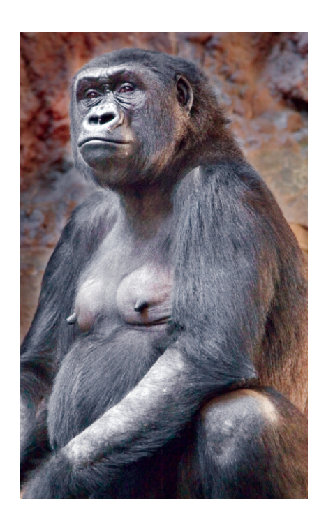
Holli, a 17-year-old female western lowland gorilla (Gorilla gorilla gorilla), lives with 21 other gorillas in the Bronx Zoo's Congo Gorilla Forest, a 6.5-acre (2.6-hectare) rainforest environment that closely resembles the western lowland gorillas' native West Africa. The Bronx Zoo's gorilla captive breeding program, the largest in the United States, produced four babies last year, bringing the total number of gorilla births at the zoo since 1972 to 57.

viral infection of the heart that's responsible," Meehan says. "It could be a response to the stress of being in captivity, in which harmful substances called catecholamines are released, or something in gorillas' diets in captivity that wild gorillas either eat or don't eat."