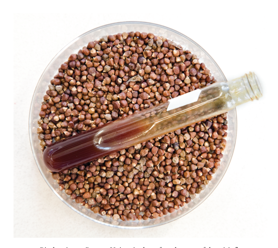
Biochemists at Rutgers University have found a powerful anti-inflammatory compound in the seeds of the African wetland plant Aframomum melegueta, or grains of paradise. The compound, named "006," has been licensed by Rutgers to Phytomedics, a New Jersey pharmaceutical company, for possible drug development. Phytomedics in turn licensed cosmetics rights to Avon Products, which will release an 006-containing skin-care line this spring.

According to a 1997 survey Dierenfeld conducted, gorillas' diets varied considerably from zoo to zoo, with more than 115 food items on the menu. Twenty different vegetables were offered on a regular basis in the survey's 37 zoos. Then there were 23 fruits, including apples, bananas, oranges, raisins, and tomatoes. "But cultivated fruits are usually lower in fiber and higher in moisture and simple sugars than native fruits eaten by gorillas