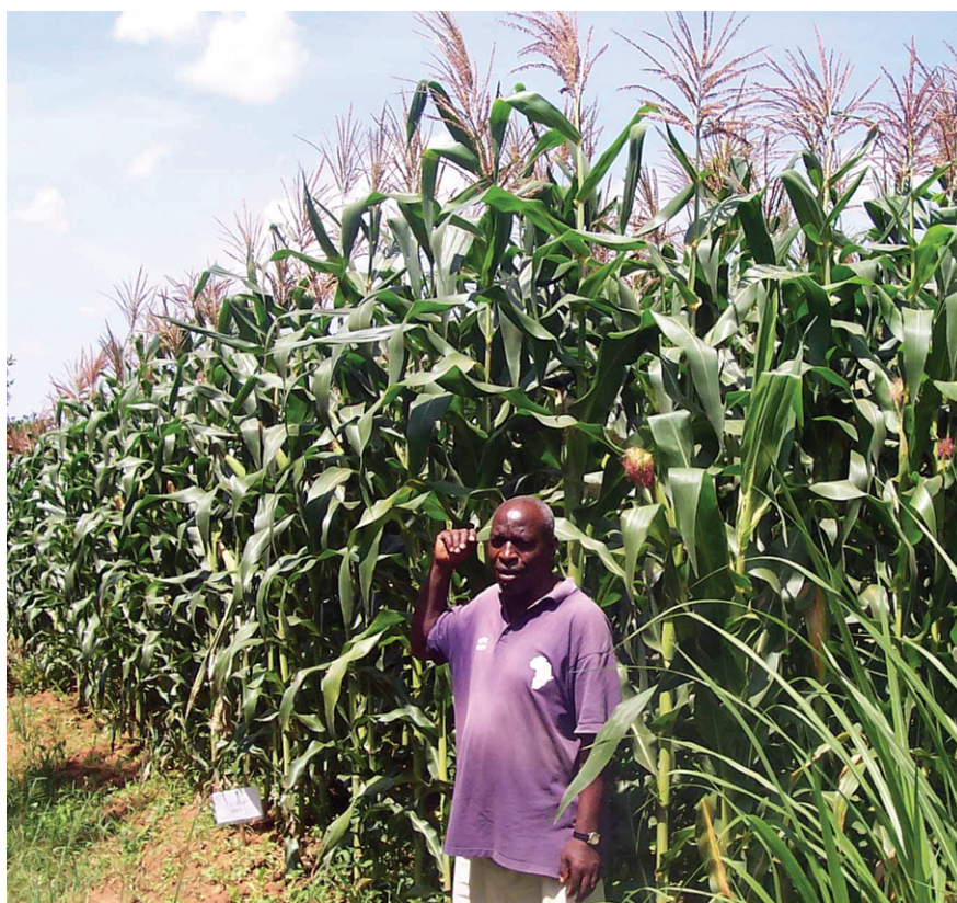
A farmer stands in his maize field near the town of Bungoma, in western Kenya. The hybrid white maize growing in this field produces about three times the average yield. It is most commonly used for porridge. Maize and cassava are the two most important crops in Africa, with the highest maize consumption in eastern and southern Africa.

Another breeder, Chrispus Oduori Adeti, focuses on finger millet in western