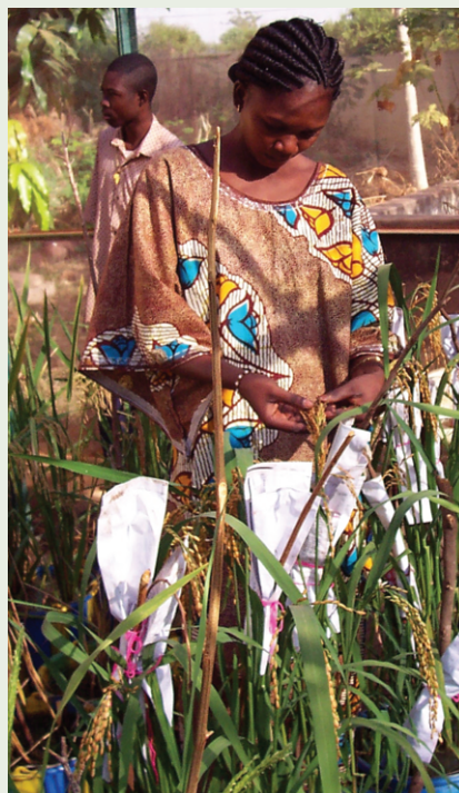
A student intern makes crosses between African and Asian rice at the Sikasso Research Center in Mali. In Africa, there is one indigenous rice species, Oryza glaberrima , which was domesticated in the northern Niger valley by Africa's first farmers. An introduced Asian species, Oryza sativa , is currently the dominant rice species in Africa.

The population of sub-Saharan Africa is growing, with about 70 percent now living in rural areas, yet African agriculture is not growing fast enough to meet the dietary needs of African communities or provide farmers with sufficient livelihoods. Numerous episodes of pre- or postharvest hunger, extreme environmental stresses such as drought and intense pest and weed infestations, and the insufficiency of global trade for African food needs further weaken the agricultural situation in Africa. In re-