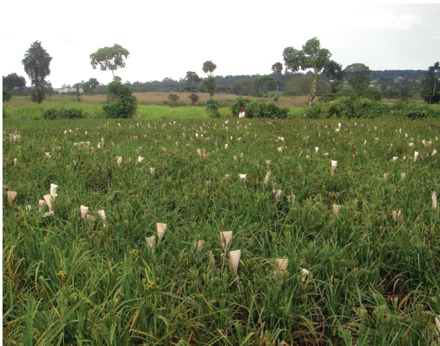
In these test plots at the Kenya Agricultural Research Institute, Chrispus Oduori Adeti is breeding for higher yield and resistance to the fungal disease neck blast. Finger millet is an important food crop because of its long-term storage capacity and its high nutritive value, making it important in the diets of children and expectant and breastfeeding mothers.

gen populations.” Currently, he says, “work is at the phase of conducting field trials for the lines [246 in number] we have so far established from our various breeding crosses using the conventional breeding methods. We are conducting participatory, variety selection trials with the farmers so as to address the farmer requirements, and at the same time evaluating the lines for the various biotic and abiotic stresses.”