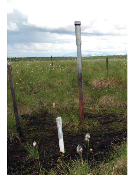
Each year the permafrost temperature at this bore hole gets measured.

as warming continues. They're employing an interconnected set of experiments, including sophisticated radiocarbon dating techniques.