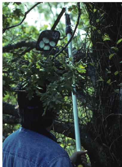
On shore, citizen scientists use mirrors attached to poles to see inside the nests and count the number of eggs and chicks of shorebirds on islands in the Boston Harbor.