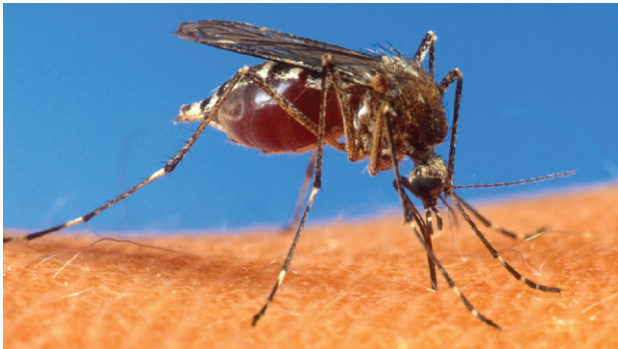
The Aedes aegypti mosquito, found in wet tropical and subtropical regions worldwide, is a vector for the viruses that cause yellow fever, dengue fever, and Chikungunya fever. Photograph: US Department of Agriculture.

T. Jonathan Davies tries to anticipate emerging infectious diseases with this map showing the convergence of high human population density and possible risk of pathogens crossing to humans from nonhuman primates. Although the map does not take into account that wild primate population densities are likely to be low where human population density is high, areas of potential for transmission of diseases can be assumed. For example, West and Central Africa stand out as putative hotspots (orange and red), as do parts of Asia, where high human population densities may make the spread of emerging diseases particularly rapid. Courtesy of T. Jonathan Davies, University of California–Santa Barbara.