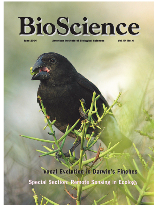
If West Nile virus reaches the Galápagos, the rare and unique Darwin's finches, such as this medium ground finch ( Geospiza fortis ) from Santa Cruz Island, may be vulnerable to infection and death.

Is there any way we can protect the human population from zoonotically derived epidemics? Surveillance of the wild bird population is one thing that can be done. Olsen and his colleagues, based at the Ottenby Bird Observatory on Öland, an island off the southeastern Swedish coast, travel around the world capturing wild birds and taking samples. Depending on the study, they take cloacal swabs or fecal samples, or they remove ticks from birds' bodies. The group's surveillance of wild bird populations, especially duck species, which