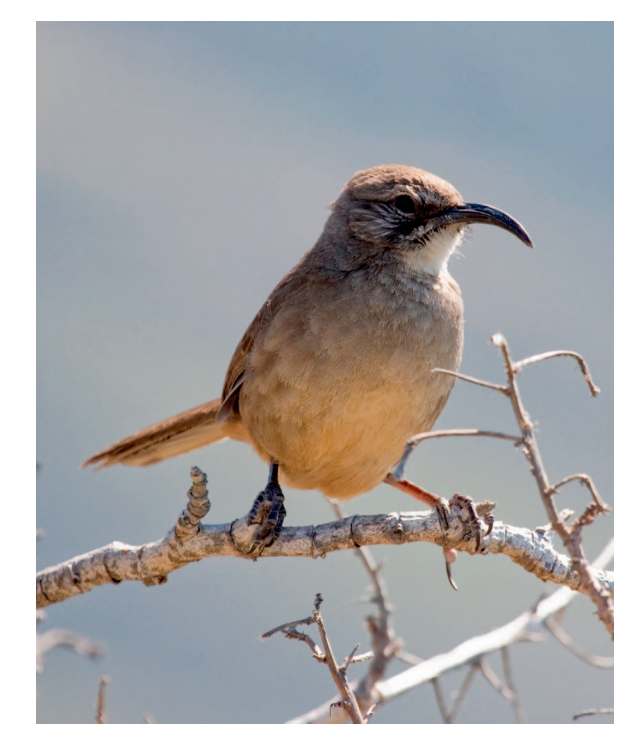
FIGURE 2. California Thrasher ( Toxostoma redivivum ).

Like Grinnell, Hutchinson (1957) emphasized the role of biological interactions, particularly in reducing the fundamental niche of an organism to its realized niche. Hutchinson's characterization of the niche as an ndimensional hypervolume led the way to the use of multivariate statistics, which Frances James, the first