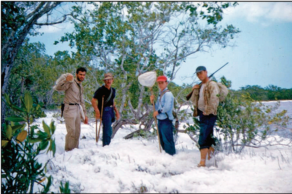
Fig. 1. George Rabb (far left) with colleagues on Great Inagua during the Bahamian Island expedition in 1952–1953. The white foam was blown in from the salt pond to the right. This is Figure 5 in Rabb and Hayden (1957).

collecting localities and making collections of insects (45,927, 17 orders), amphibians (684, 2 genera), reptiles (2106, 12 genera), and mammals (67, 4 genera). The extensive trip report was written by Rabb and entomologist Ellis Hayden (1957). In his typical style of understatement, George managed to include this line in the report (p. 18): “Daytime collecting was done in the morning and latter half of the afternoon, as midday was often too hot for insects, reptiles, and collectors.” Later, a line hints to traditional misadventures of field work (p. 25): “...except that on the latter day our pursuit of the numerous little geckoes ( Sphaerodactylus ) under fallen palm fronds was quickly halted when we uncovered several wasp nests.” or misadventures not so familiar to herpetologists (p. 26): “Later, while attempting to enter a shallow harbor near Hawks Nest Point, we went aground on a reef, but luckily a near-by construction crew pulled us off with their barge.”