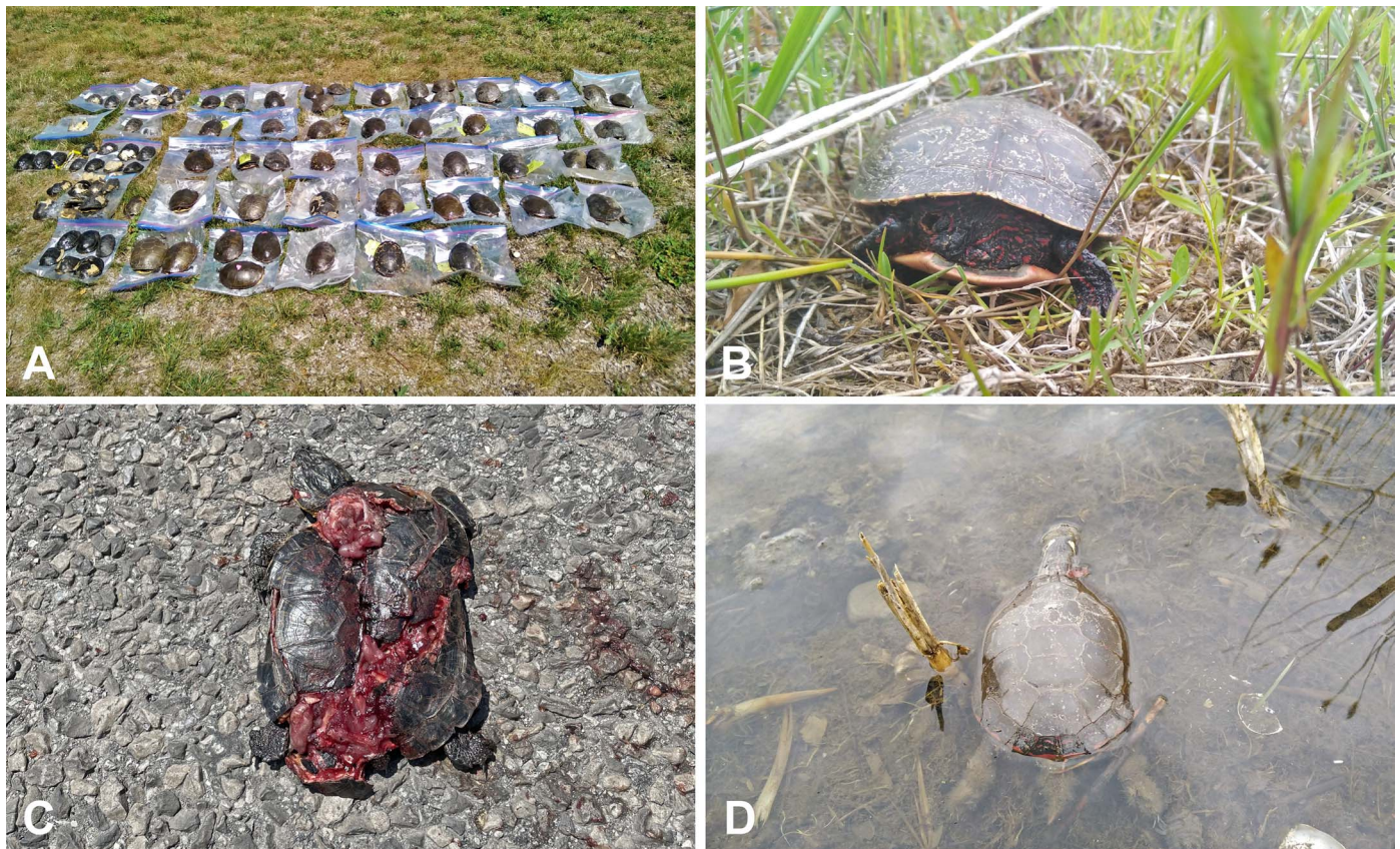
Fig. 1. Turtle mortality observed from 2020 to 2022 in Rouge National Urban Park, Ontario, Canada. (A) Carcasses of Midland Painted Turtles ( Chrysemys picta marginata ) and headstarted Blanding's Turtles ( Emydoidea blandingii ). (B) Close-up image of a depredated Midland Painted Turtle with decapitation. (C) Blanding's Turtle mortality as a result of vehicular collision. (D) Midland Painted Turtle mortality from winter-kill.

when there was excessive bodily damage (e.g., cracked carapace and/or plastron) to carcasses located on or near a road. Winterkill was the documented cause of death when carcasses with no obvious signs of injuries or damage were observed in the winter or spring. Unknown cause of death was documented when there were no obvious signs of injury or damage on carcasses found outside of winter or spring, when destruction and/or decomposition of the carcass was too advanced to determine any signs of injury or damage, or as a result of missing data. Carcasses collected/identified by Parks Canada staff, who have regular presence in the RNUP, were also included in our summaries and analyses.