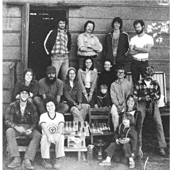
FIG. 2. —My 1st mammalogy class at Louisiana State University in 1979. At least 3 students in this class became professional field biologists, and there may have been others.

The increasing number and complexity of regulations. —Bureaucratic regulations, including foreign, federal, state, and local research permits; permits for collection, importation,