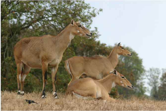
Fig. 2. —Three tawny-colored female Boselaphus tragocamelus in a game park in Roseburg, Oregon, United States; note the characteristic white cheek spots and the 2 white rings above the fetlocks, which led to the early common name, white-footed antelope.

74.7 of the International Code of Zoological Nomenclature (International Commission on Zoological Nomenclature 1999:83; K. Helgen, Smithsonian Institution, pers. comm.), such a designation cannot be made after 1999 without meeting 3 criteria, including “an express statement of the taxonomic purpose of the designation” (Article 74.7.3). I found no reference to such a purpose in Grubb (2005:693) and concluded that this designation is not valid under the current Code .