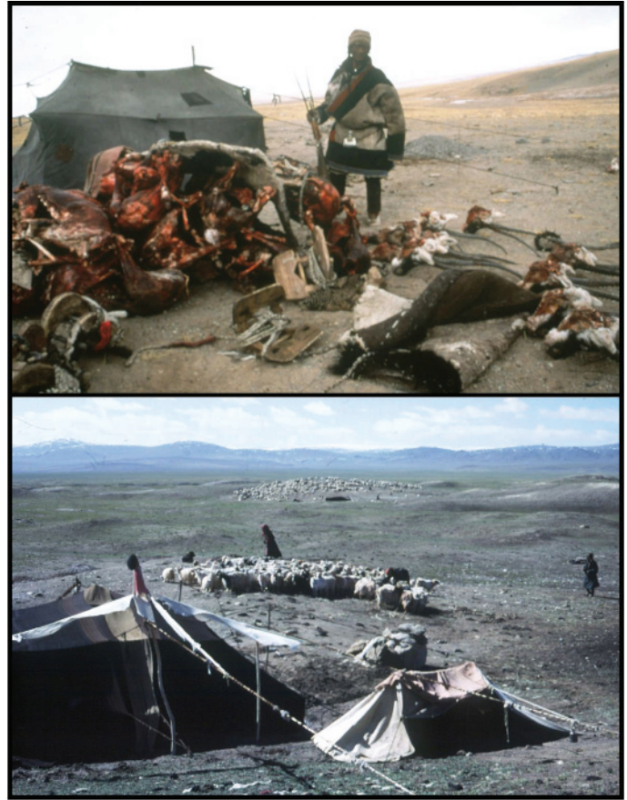
Fig. 7. —Poacher's camp with a pile of carcasses and heads of Pantholops hodgsonii in Tibet, December (top), and nomad tents and herds of sheep and goats occupy traditional range of P. hodgsonii in western Tibet, July (bottom).